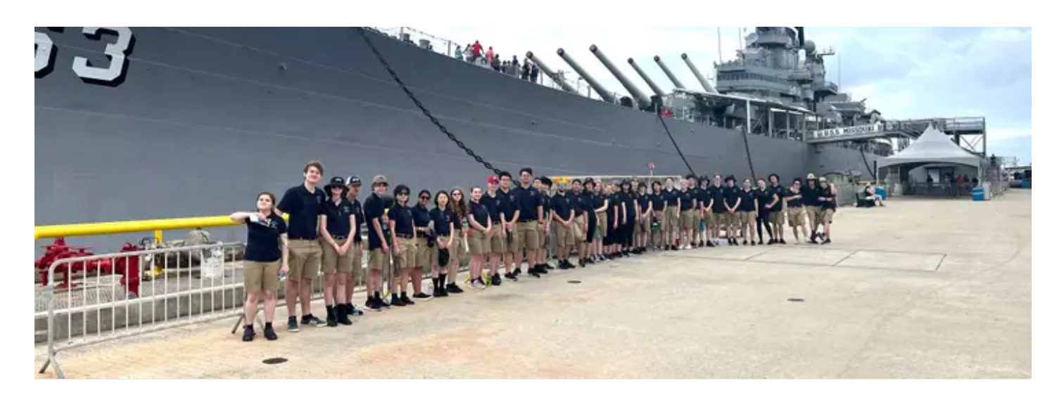
The band next to the USS Missouri.

On Saturday, April 1 at Peal Harbor, the musicians performed on the deck next to the USS Battleship Missouri Museum. It was on this ship that the peace treaty with Japan was signed in 1945 ending World War II. The performance was followed by a concert at the Pearl Harbor Aviation Museum that afternoon.