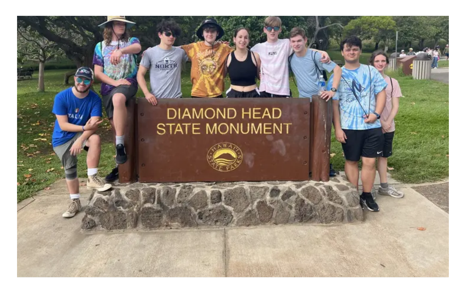
Members of the band at the Diamond Head State Monument.