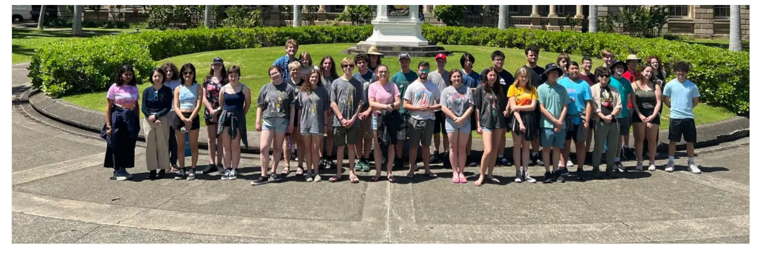
The band took a guided tour featuring the National Cemetery of the Pacific (Punchbowl), the Governor's Mansion, the State Capitol Building, Iolani Palace and the King Kamehameha Statue (above).

NEWTOWN, PA — Forty members of the Council Rock High School North Marching Band traveled to the Aloha State in early April where they performed at the USS Battleship Missouri Memorial and at the Ala Moana Center in Honolulu.