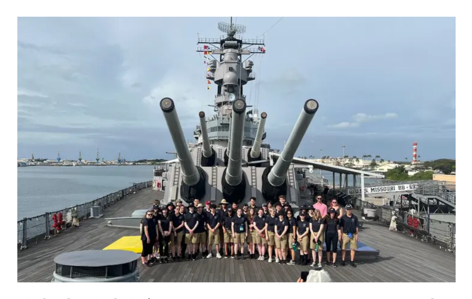
The band on the deck of the USS Missouri where the peace treaty was signed with Japan in 1945 ending World War II.